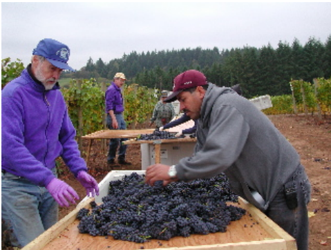
Sorting Grapes at Carabella Vineyard

(bottled at 13.9%. 475 cases produced). Initially there was a noticeable char note on the otherwise exceptionally pretty violet and deep red-toned fruit but this quickly dissipated to complement the rich, full and sweet flavors that are a bit more serious and structured than their 2003 counterparts. All wrapped in a vibrant and impressively intense finish. This too is a lovely effort with just a bit more underlying material that gives it the edge. Recommended. 91/2009+.