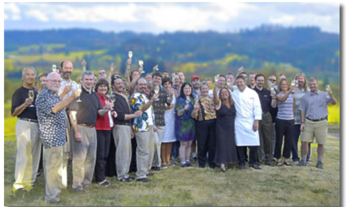
Group at PGC's July 2003 IPNC Party

A blend of Goldschmidt, Shea, Eason, Estate & Quail Hill. Intended to be a larger scale (in tannins) wine than their other offerings. Should be quite interesting. Like the Oregon in that it is a blend but using barrels from only their best vineyards-the Oregon has Bradley & Patton Valley in it-as well it will be a higher percentage of new wood than the Oregon (about 15% there) so will be fuller and richer.