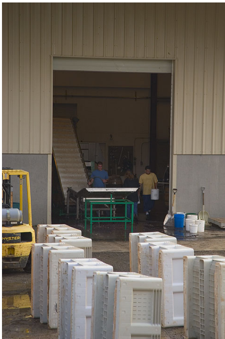
Patricia Green Cellars, harvest 2003, sorting table going up into vats