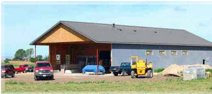
Isenhower's New wine building

Red Paintbrush is a beautiful wildflower that grows in the Walla Walla Mountains of Eastern Oregon. Red Paintbrush is also a metaphor for blending. Beginning with an empty canvas we "paint" the canvas with various red wine lots to achieve the best possible wine possible. The painting began after the first racking with various trials until just before the second racking in April 2001. Then Denise and Brett analyzed the three final works of art and present to you our final selection.